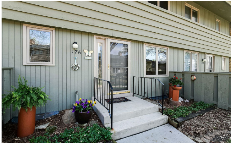
Nicely updated throughout, this unit is in a quiet corner of parklike Windsor Green