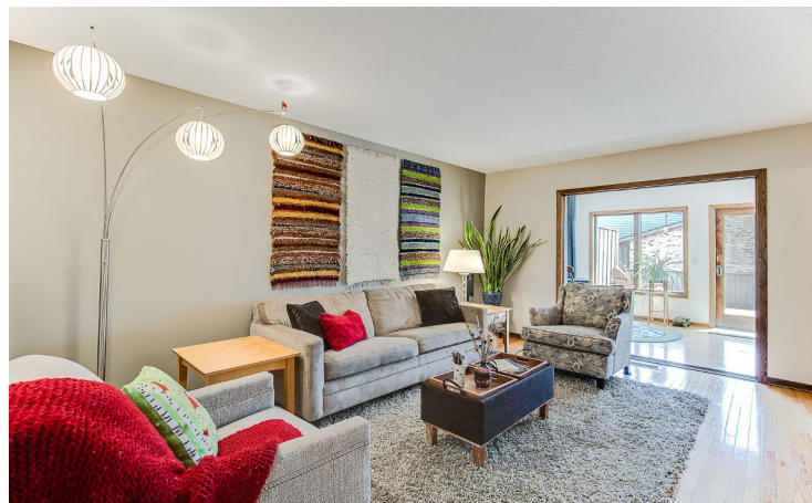
Real hardwood floors, and the bonus sun room addition brings in southern sunlight