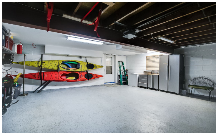
Great storage space in the pristine garage with finished floor