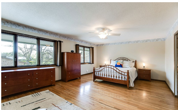
The huge primary bedroom gives options for how to use the additional space