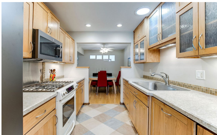
The updated kitchen is thoughtfully designed to include a light tube for natural light