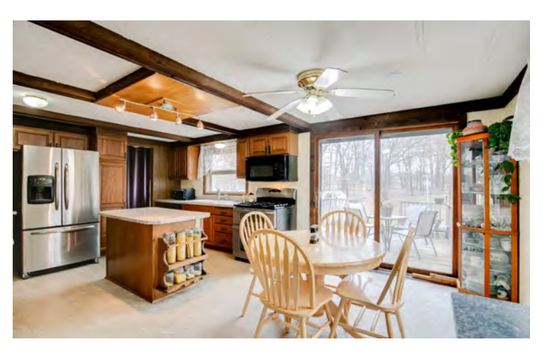
The dining area is bathed in sunlight, and walks out to the back deck and huge fenced back yard.