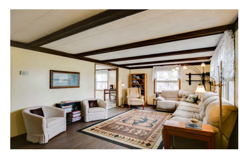
This 4BR/2BA manufactured home has been resting on a drain tiled foundation for over 40 years.