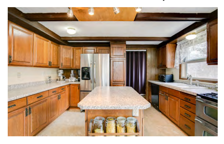
The spacious kitchen is perfect for baking, serving and cooking all at once!