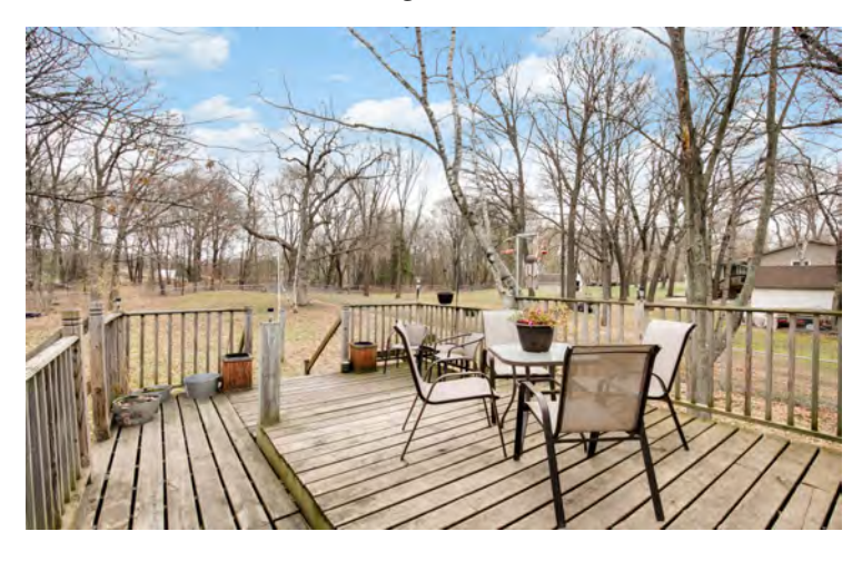
Relax on the deck, gather around the fire pit, or wander in your own 1.1 private green acre.