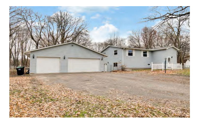
The big three-car garage is wired to the max... perfect for welding and other shop equipment.