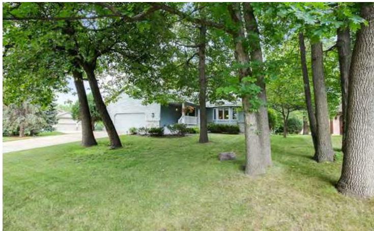
This beautiful 3BR/2BA one-story was the builder's own home, nicely situated on a wooded corner lot.