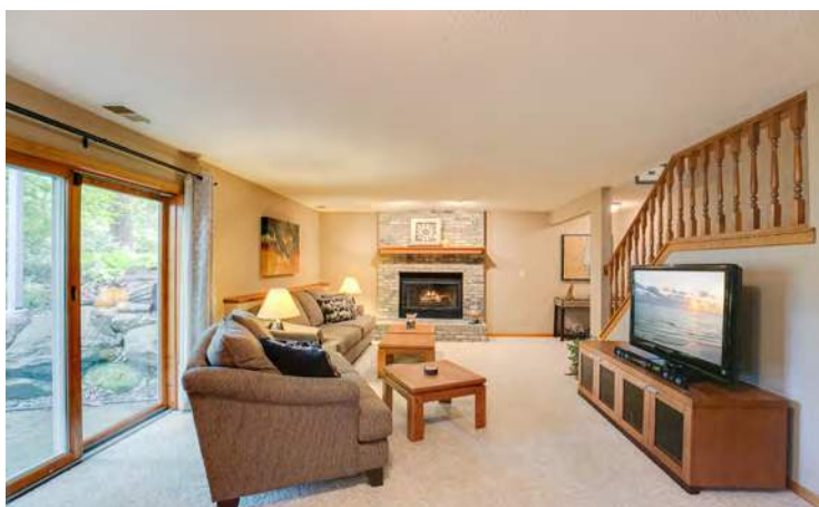
The walkout lower level creates a private suite and still has room for a big laundry and huge storage area.