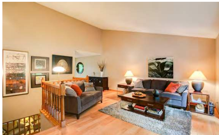
Gorgeous pecan hardwood floors flow throughout the spacious main floor living areas.