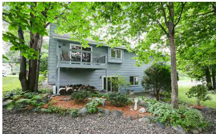
The charming wooded back yard feels like your own private, enchanted garden.