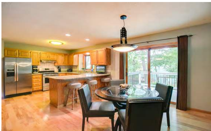
The cabinets were custom built on site, and the kitchen and bathrooms all have solid granite counter tops.